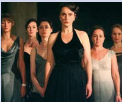
Trojan Women, at the National