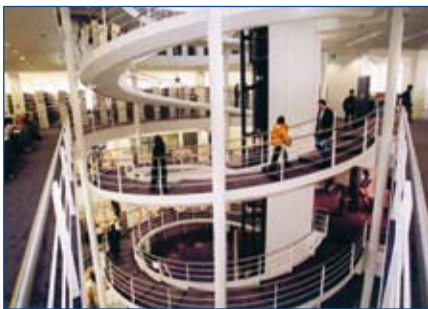
The famous LSE library