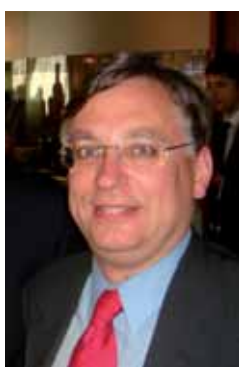
MP Andrew Dismore

Hot political debate dominated the agenda on the visit of local MP Andrew Dismore to the College on 19th November. Mr Dismore has been the Labour member for Hendon since 1997; he chairs the Commons Joint Committee on Human Rights and sits on the Standards and Privileges Committee - a very busy man, so we appreciated his spending the time to come and hear students' concerns about the Iraq war, the situation in the Middle East, the economy and the recent scandals over MPs' allowances.