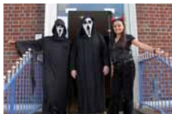
The Halloween welcoming committee

Spiders' webs and tiny flitting bats, trailing through our hair as we made our way to class more warily than usual, foreshadowed a Halloween gathering of white witches and gentle ghouls in late October. Teachers and students alike doffed academic formality to connect with their inner pagan and dress up in cowls, masks and theatrical make-up, paying £1 to the charity "Make a Wish" for the privilege (and £2 if they didn't dress up!). On arrival at College, a horrifying 'Scream'-masked figure awaited students to collect their donations in his pumpkin basket, and the devil himself ran around selling treats (for souls). Many thanks go to supportive students and staff. £325 was raised for 'Make a Wish' on the day, and we cannot wait to organise further fundraising events, enabling the granting of more wishes to children with life-threatening conditions.