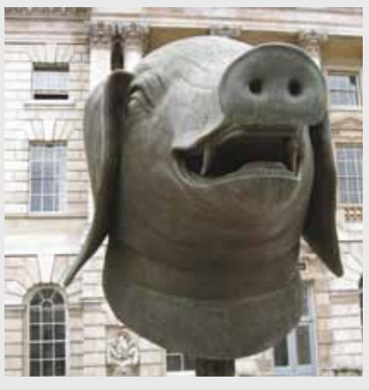
The pig, a peace-loving and generous creature in zodiacal lore.

The other-worldly animal heads made by Chinese dissident artist Ai Wei Wei at Somerset House, seen by Brampton students this term, have taken on a depressing political significance after Wei's house arrest in April, their aesthetic freedom weighed down by the thought of the artist's imprisonment. The twelve heads - representing the years of the Chinese zodiac - refer to China's past: the original versions of them were designed by 18th century Jesuits serving the Chinese court, ransacked by British and French troops in 1860. Wei's version restores the harmony of the zodiacal circle, while the bared teeth of the huge iron heads dispel any sense of cosiness. Like the courage of their artist, they command respect.