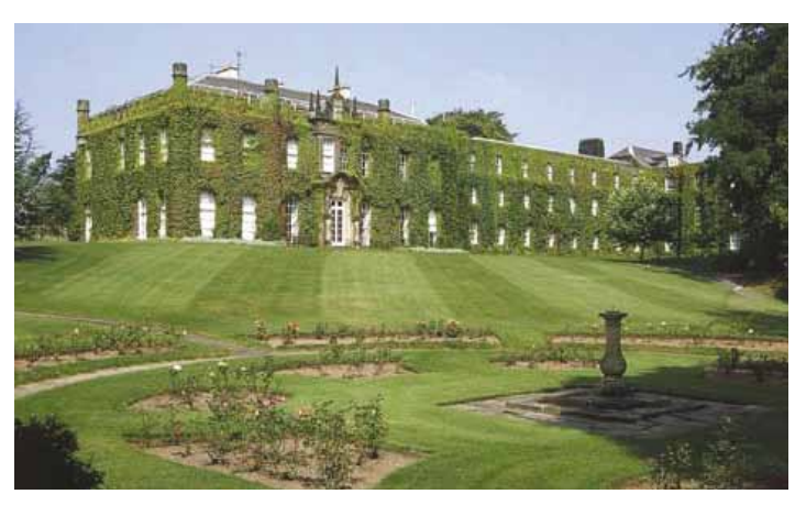
Hugh Stewart Halls, Nottingham University

A sunny riverside stroll from Guy's to the Strand revealed the exciting advantages of King's city location, and by the end, many were ready to pencil King's into their UCAS plans.