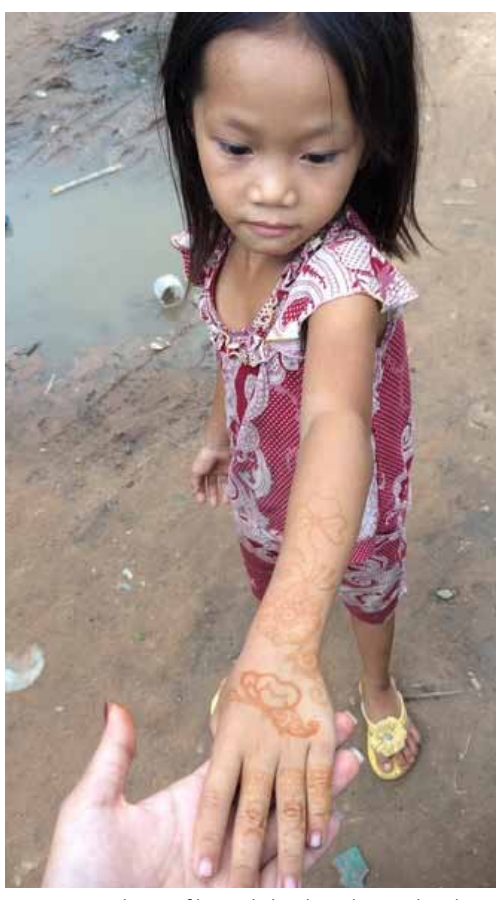
Learning the art of henna helps the girls to make a living

I went to Cambodia to teach these girls, but I ended up learning a lot from them. Things that we take for granted like food, education, hygiene, healthcare, safety, opportunities, happiness and a loving family are a dream for them. I was given the chance to make a difference in the lives of 33 girls. This was not just a one off trip for me. I will not stop helping the SENHOA foundation. You can visit the website Senhoa.org and if you think you can help in anyway, please don't hesitate. We are all lucky and blessed where we are in our life, and if we can make a tiny difference in someone else's life, why not?