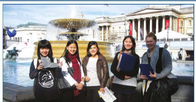
The Monopoly Run