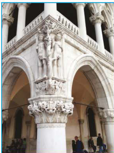
Adam & Eve, Piazza San Marco