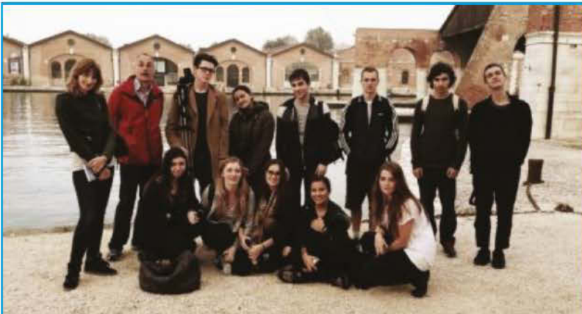
Staff and students at the Biennale